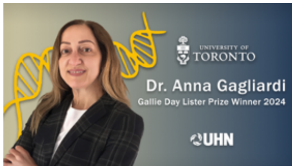
Honouring Surgical Research /read more