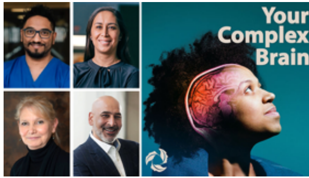
Season 3: Your Complex Brain Podcast /read more