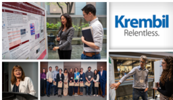
Krembil Research Day 2024 /read more